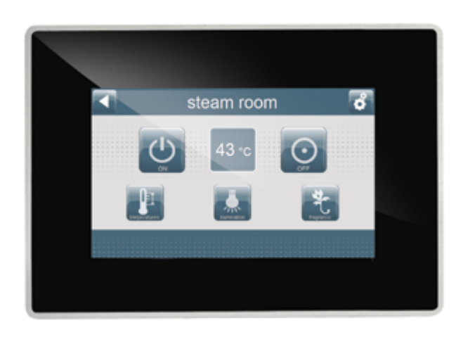
Touch Display, 4,3", 64000 colours

Systems for the complete control of steam rooms, their components (steam generators, fragrance dosing, illuminations, exhaust- and supply fans etc.) and parameters (temperature, humidity etc.) from one touch screen display. The control systems are planned and produced projectbased. Therefore the systems can be adapted individually to the special requirements of a project. With regards to the specification it is for example possible to operate a steam room in different operation modes (e.g. Classical Steam Room, Hammam, Tepidarium, Healing Clay Seam Bath, Salt Steam Room). For the operation and visualisation we use clearly designed and intuitively arranged touch screens from 3,8" to 7". They can be programmed in several languages. Furthermore measured values, current operational status and alarms can be displayed with each browser driven device such as a PC, smartphone or tablet.