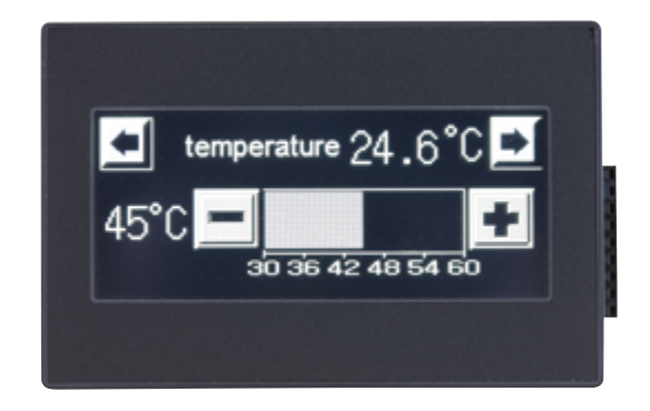
Touch Display, 3,8", 32 greyscales